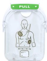
Philips Heartstart HS1 Adult electrode pads £49 excl. VAT