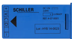
Schiller Fred Easy Lithium Battery £129 excl. VAT