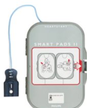
Philips Heartstart FRx smart II electrode pads £44 excl. VAT