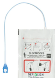
DefiSign Life Electrode Pads £54 excl. VAT

Shop our wide range of defibrillator electrode pads for all brands of Automated External Defibrillators. Replace electrode pads before the expiry date to ensure that they work when you need them the most. Most defibrillator electrode pads have a shelf life of around 1.5 - 3 years.