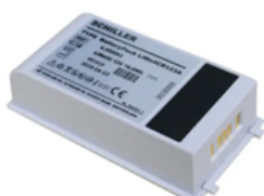
BatteryPack DefiSign Pocket Plus / FRED Easyport Plus £149 excl. VAT

Every defibrillator battery has an expiration date. Please replace the battery in time to ensure a fully functioning device. A beeping sound or flashing light on the AED also indicates that the battery needs to be replaced. Most AED batteries can easily be replaced by yourself. After inserting the new battery the unit will require a self-test (check user manual for guidance). The device is now ready for use; the status indicator will also confirm this.