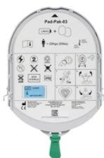
Heartsine Samaritan Adult PAD PAK £99 excl. VAT