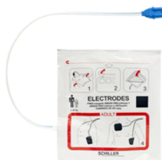
Schiller Fred Easyport adult electrode pads £49 excl. VAT