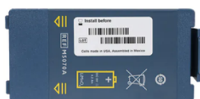
Philips Heartstart HS1 and FRX battery £119 excl. VAT