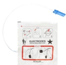
Schiller Fred Easy adult electrode pads £35 excl. VAT